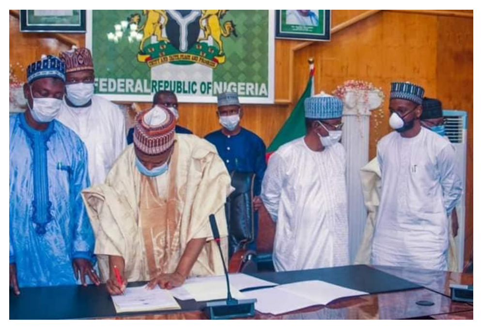
Gov Bagudu signs N99.7bn amended budget for 2020

The objective of the Citizen budget is to present State budgetary information in a manner that is easily digestible for Citizens and is to facilitate engagement between